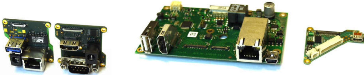
Examples of standard break-out boards

Because of the numerous interfaces it is not feasible to put the respective industry-standard connectors onto the camera. Also customers often have special mechanical requirements. Therefore, all interfaces are accessible via small KEL micro-coax, JST or FFC connectors. These can be routed to simple break-out boards which can be either our standard boards (e.g. for evaluation or when they fit the application) or custom designed boards. Example schematics can be provided to the customer.